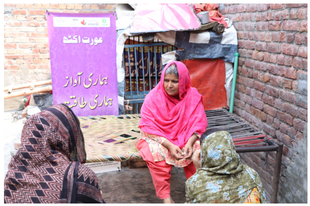
Members of Aurat Akath Wandala Dyal Shah, Shahdhra discussing their issues at the monthly meeting of the center