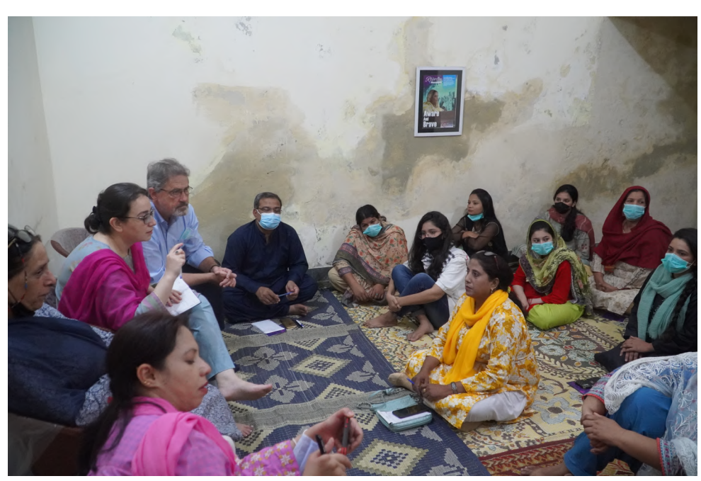
Representatives of WISE partners in Aurat Akath – Global Affairs Canada and Oxfam visiting a center

Following are the findings of the 250 respondents.