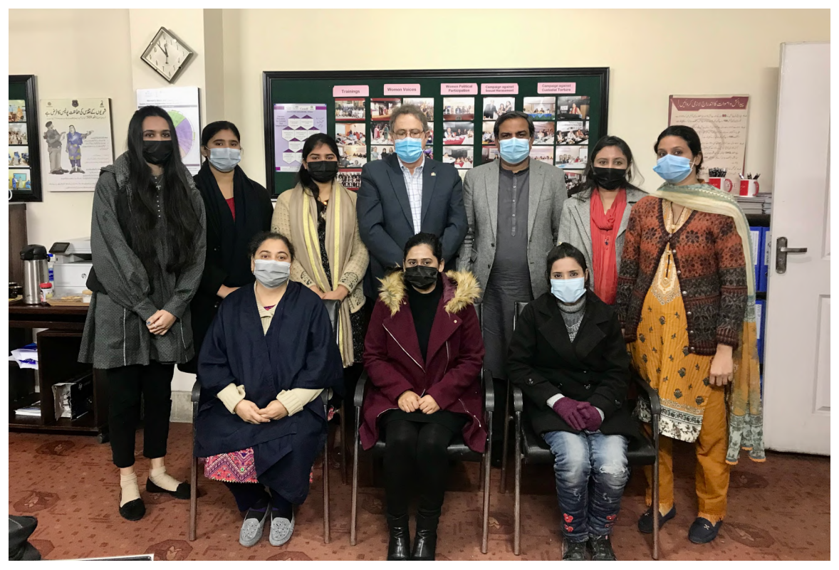
WISE and Global Affairs Canada Team