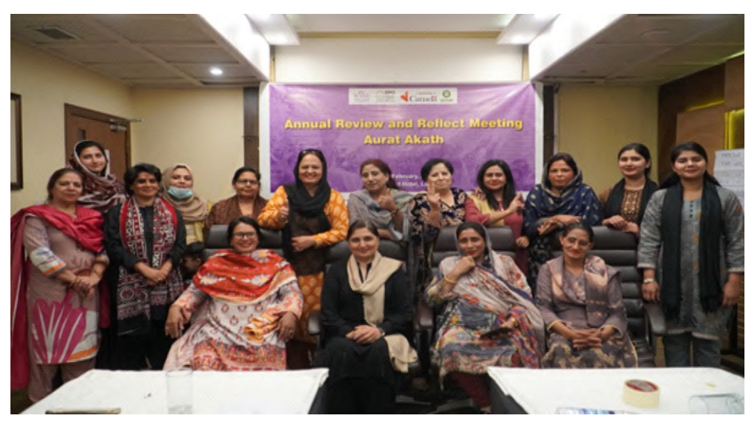
Exploring progress and challenges – the annual review and reflect meeting

Building on these 10 Aurat Akath (Women Reflect Centers) and part of further consolidation, in 2023 three (3) district level Aurat Akath have been evolved, each comprising 09-12 members. These district level structures, besides promoting the second level women leadership, are meant to address specific instances of violence against women, providing support and resources to victims and their families through referral mechanism. These shall also liaison with Public and Private departments for fixing local municipal issues, facilitating implementation of the Aurat Akath action plans, and other need-based initiatives.