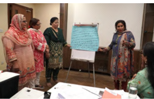
The effort bears fruit indeed – A few glimpses of various seminars, workshops, and visits

The focal persons were trained as community leaders through capacity strengthening workshops to resolve the issues of women in their areas and build their strong association with communities. The topics of the workshop were included; psycho-social well-being, pro-women laws, available support mechanisms, gender & protection, community mobilization, leadership skills and record keeping. They were motivated to continue their work and input voluntarily.