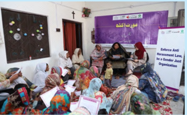
A view of monthly meeting of Aurat Akath, Youngsun Abad