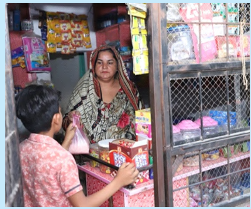
At her grocery shop