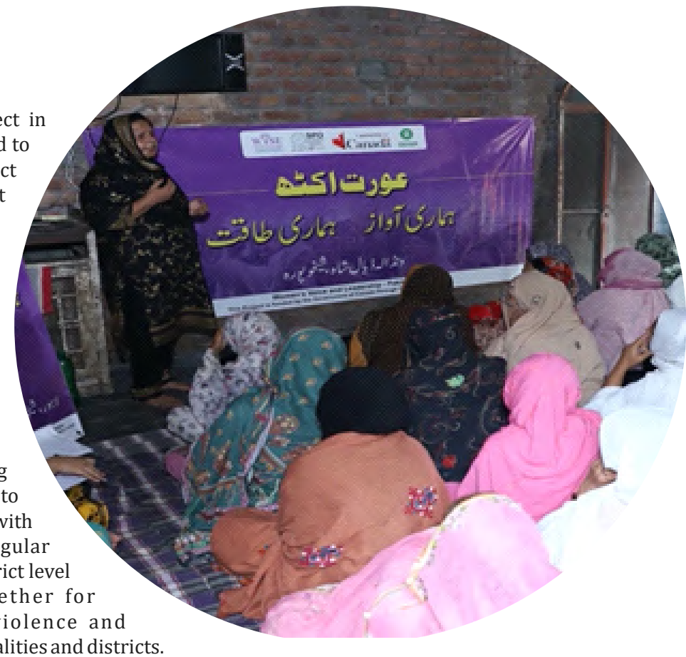
The Aurat Akath at one of the centers

Towards the end of the project in 2023 all the 10 centers decided to organize themselves at district level and formed their 3 District Level Aurat Akaths, one each in Lahore, Sheikhupura and Nankana sahib. Each district level structure comprises 9-12 members. The Aurat Akath centers experience was so worthwhile for the members that focal persons of these three district level centers resolved to continue these centers even after ending of WVL project. Their plan is to keep these centers functional with community self-help and regular support of WISE. The new district level structures will work together for countering gender base violence and development issues in their localities and districts.