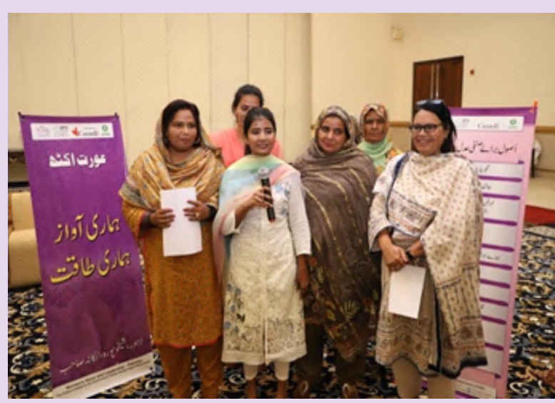
A young participant expressing her views at a meeting