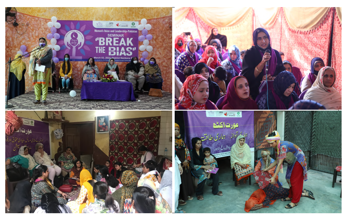
Activity at different centers of Aurat Akath

with others, share experiences, foster self-expression and cultivate critical consciousness.